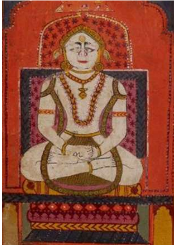
IMAGE OF CHANDRAPRABHU

He enlightened the people and propagated true religion for a considerably time. Eventually, after a month long fast and intense meditation, he attained Moksha at Samet Shikhar.